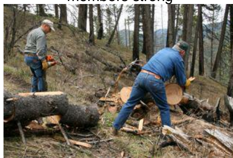
Trail maintenance on the John's Creek Loop Trail off the South Fork of the Clearwater River

National Trails Day at Wilderness Gateway, Clearwater National Forest. Trail maintenance & weed spraying were done. A steak feed & potluck at the pavilion finished out the day.