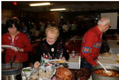
We ate well.

End of the Year Christmas Potluck & Awards Presentation.