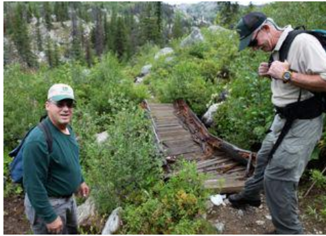
Canteen Creek Bridge review with District Ranger

Total rebuild on a bridge in the Black Lakes area, Seven Devils - Hells Canyon NRA