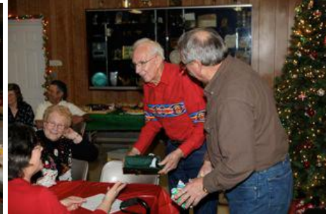
The ever popular gift exchange.

BACK COUNTRY HORSEMEN OF NORTH CENTRAL IDAHO had 138 members in 2010. The chapter has individual members who take on projects such as working with the Selway Bitterroot Foundation, assisting the Northern Region Pack String & taking part in the Forest Service Stewardship Program during hunting season to act as a liaison with horsemen. Because we have an active and engaged Public Lands Chairman we were able to perform a field review with the Moose Creek District Ranger and change a decision he had made regarding trail bridge removals on a main access trail into the Selway Crags.