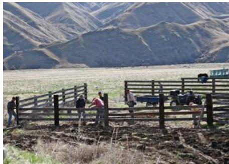
Corral rebuild, Pittsburg Landing-Hells Canyon National Recreation Area. Work group, 30 members strong